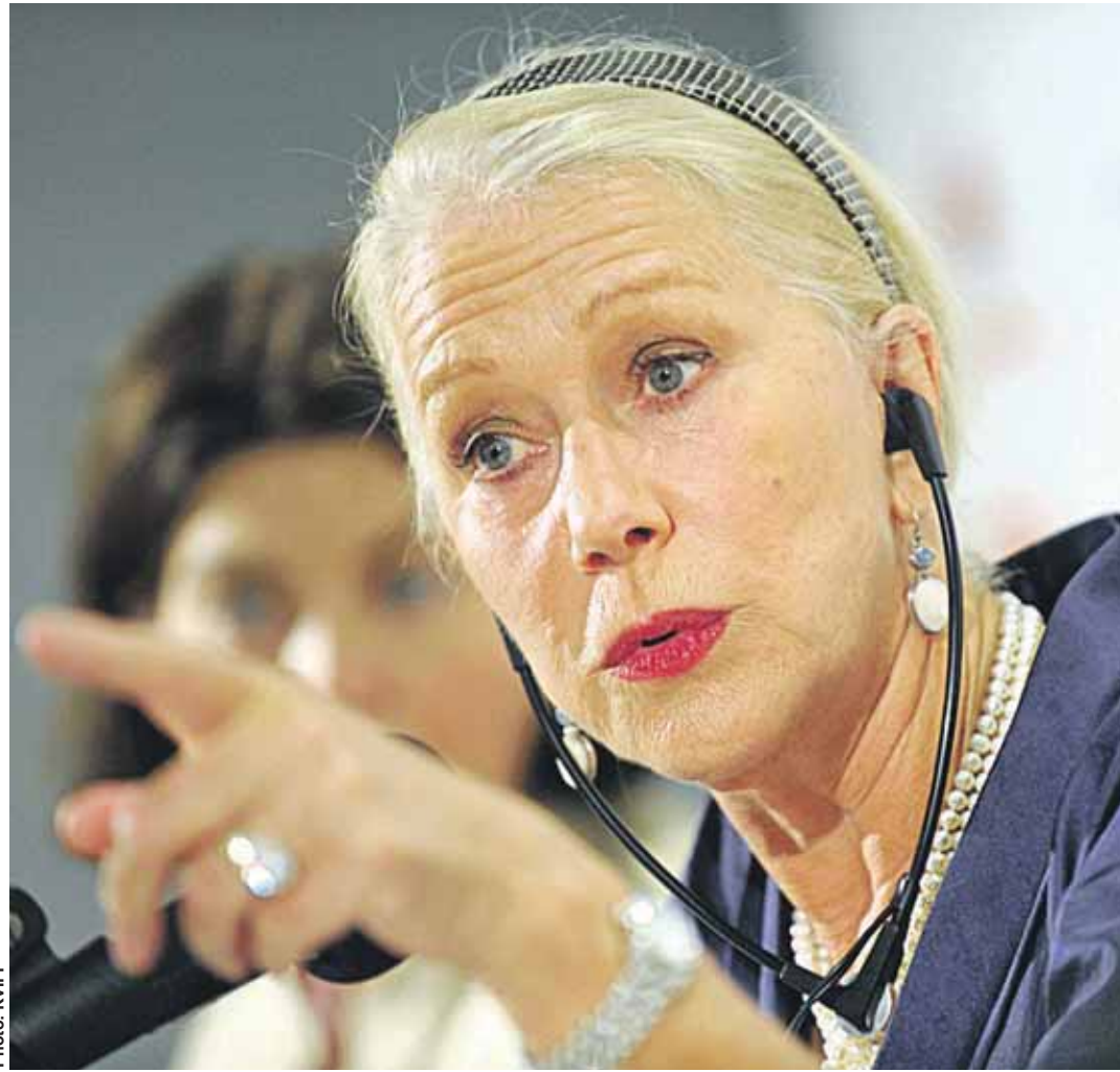
Helen Mirren holds court at the Thermal.

The Door was, honestly, one of the hardest things I've ever done. It doesn't look like that to the eye but I think I felt the responsibility of the fact that it was a Hungarian story, a Central European story, to do with the whole history of Central Europe,