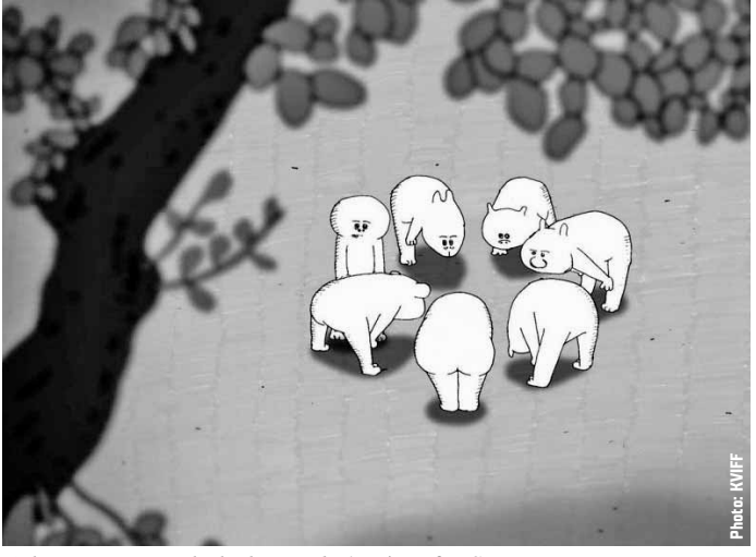
Saki Muramoto's light-hearted It's Time for Supper