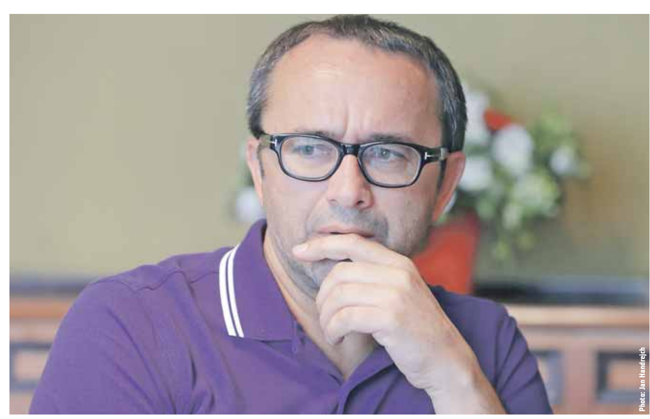
Andrey Zvyagintsev's new film Leviathan might not be screened widely in Russia due to a new profanity law.

Laws are the only way to regulate power. And if you can't enforce them or change the bad ones, all that remains is to be loyal to the state, the regime. It be-