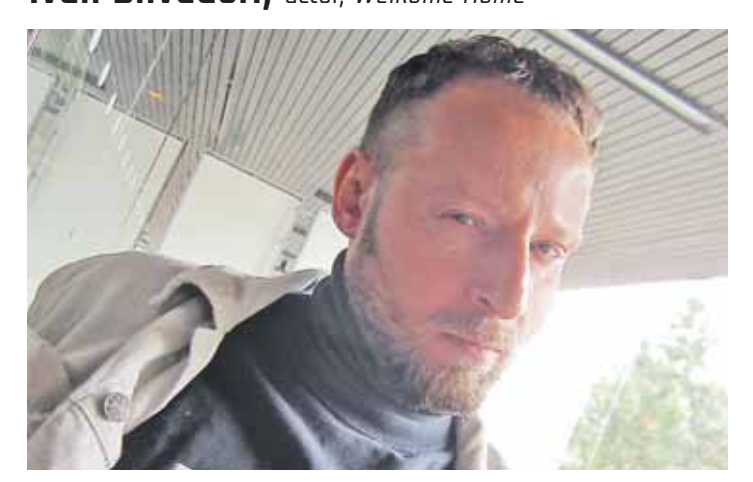
So you're here helping to festivals. That's the only f***ing present a film? thing I can tell you right now.