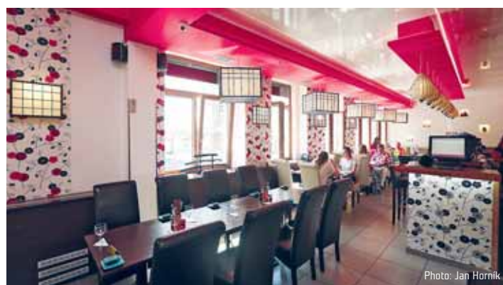
Not just a Japanese restaurant, but Sushi Sakura does a great spicy tuna roll

Sushi Sakura offers good sushi and a variety of Japanese and other Asian dishes with the option of sitting outside and watching all the action of the festival in full swing or heading into the cool interior for some quiet time as you digest the latest screenings along with a decent plate of fishy morsels. The lunch menu offers 8-piece sushi sets for as little as 160 CZK with a bowl of soup thrown in for good measure, spicy tuna roll for 165 CZK and veggie op-