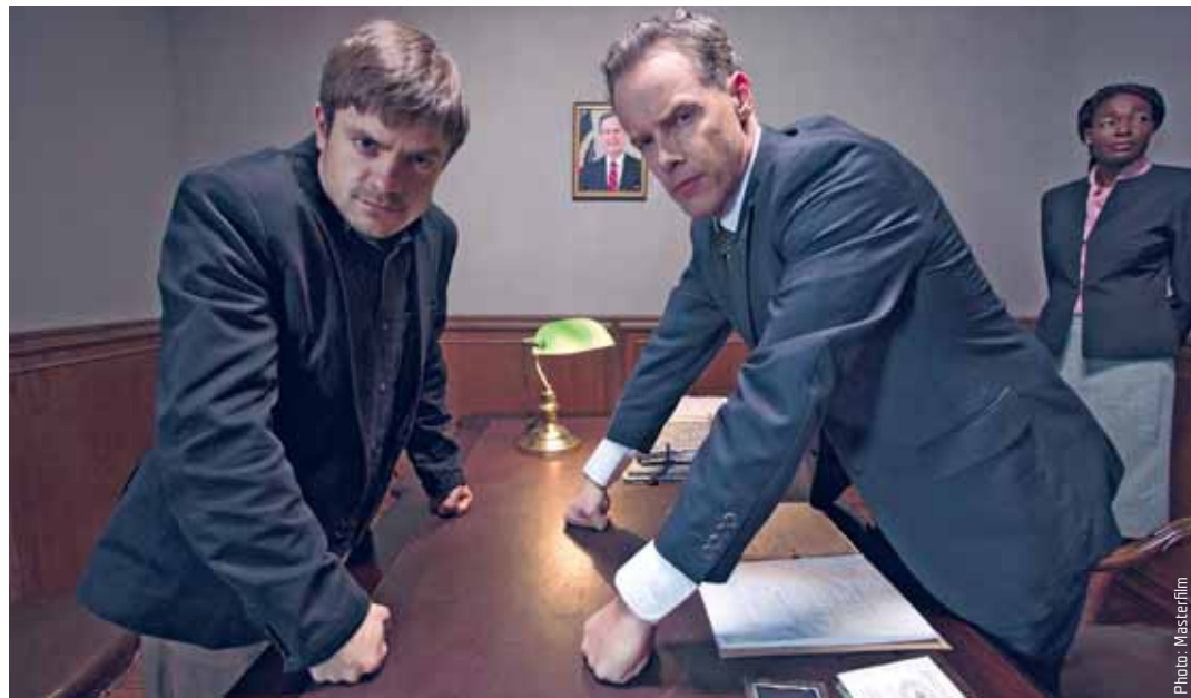
Jiří Mádľ (left) plays Jan Němec as an angry young man who stuck to his principles and made brave choices