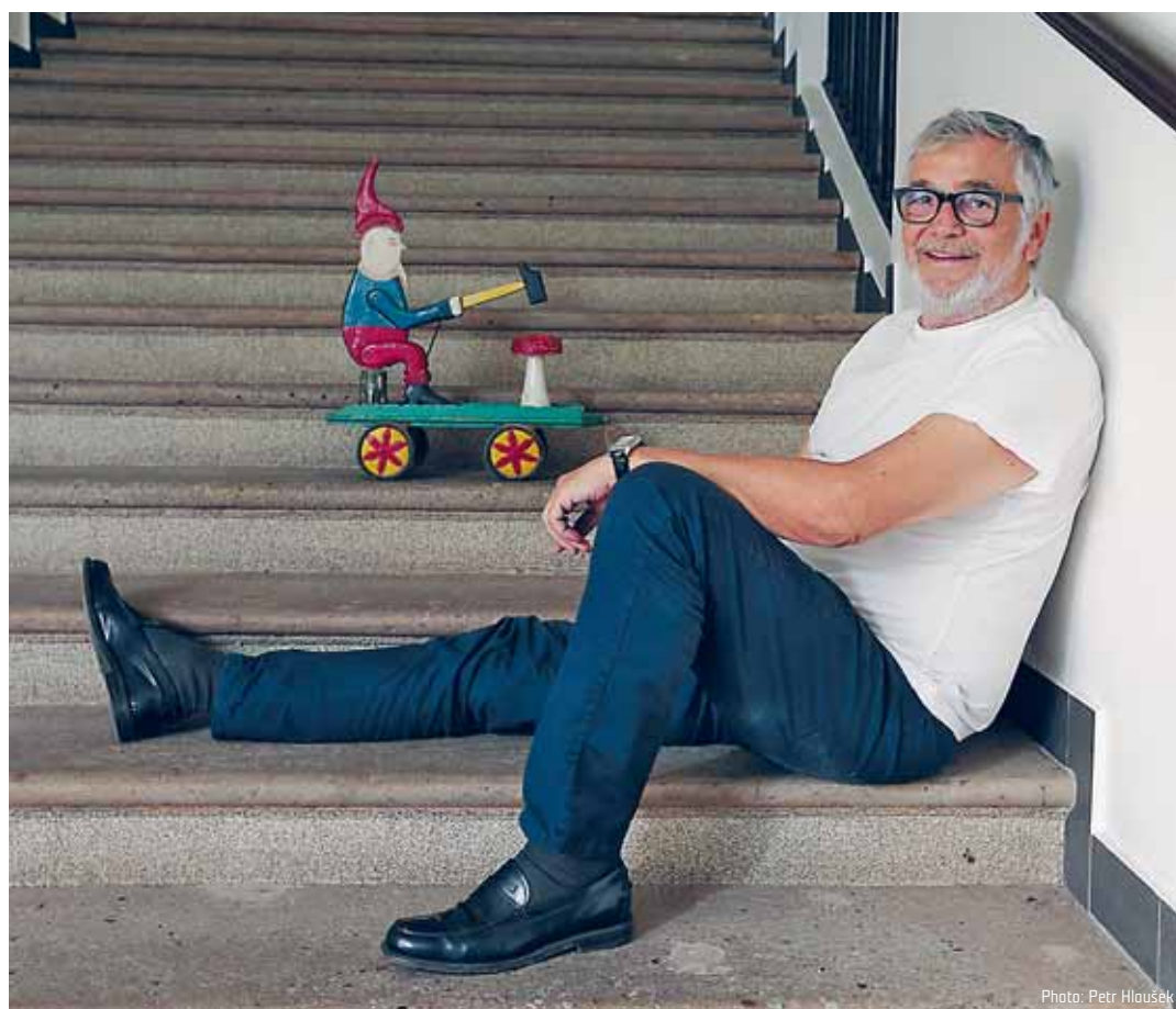
KVIFF President Jiří Bartoška gives an outstanding performance after having tackled a serious illness