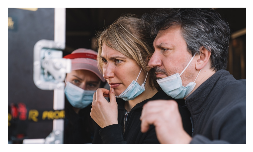
How did you imagine your two female characters, Vesper and Camellia?