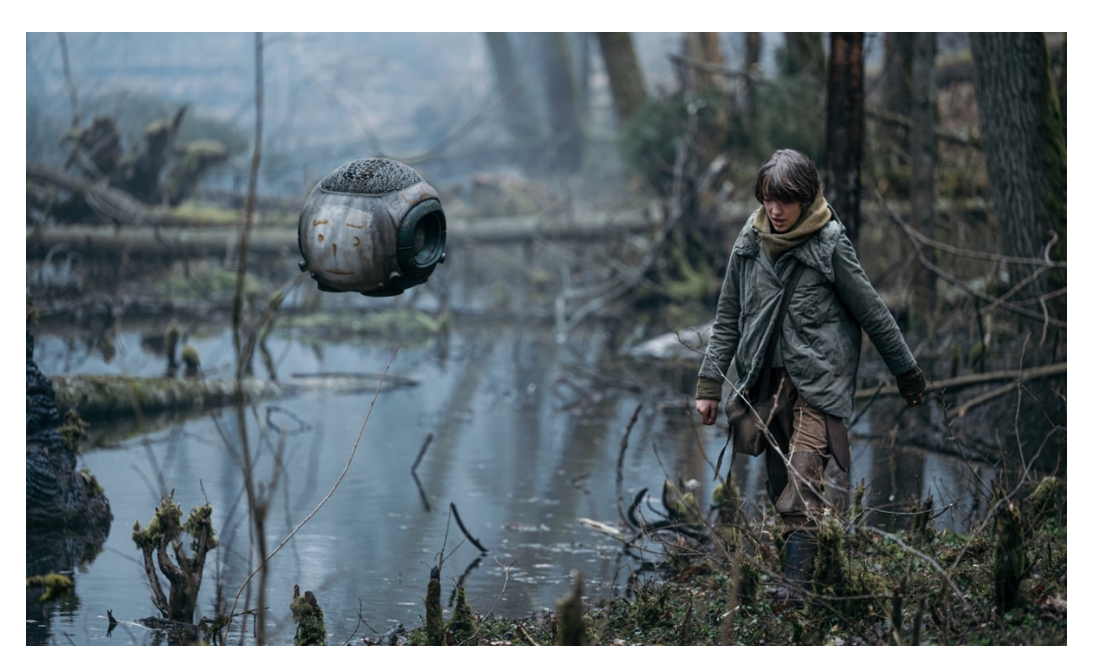
Lithuania, France, Belgium / 2022 / 114 min / Color / English